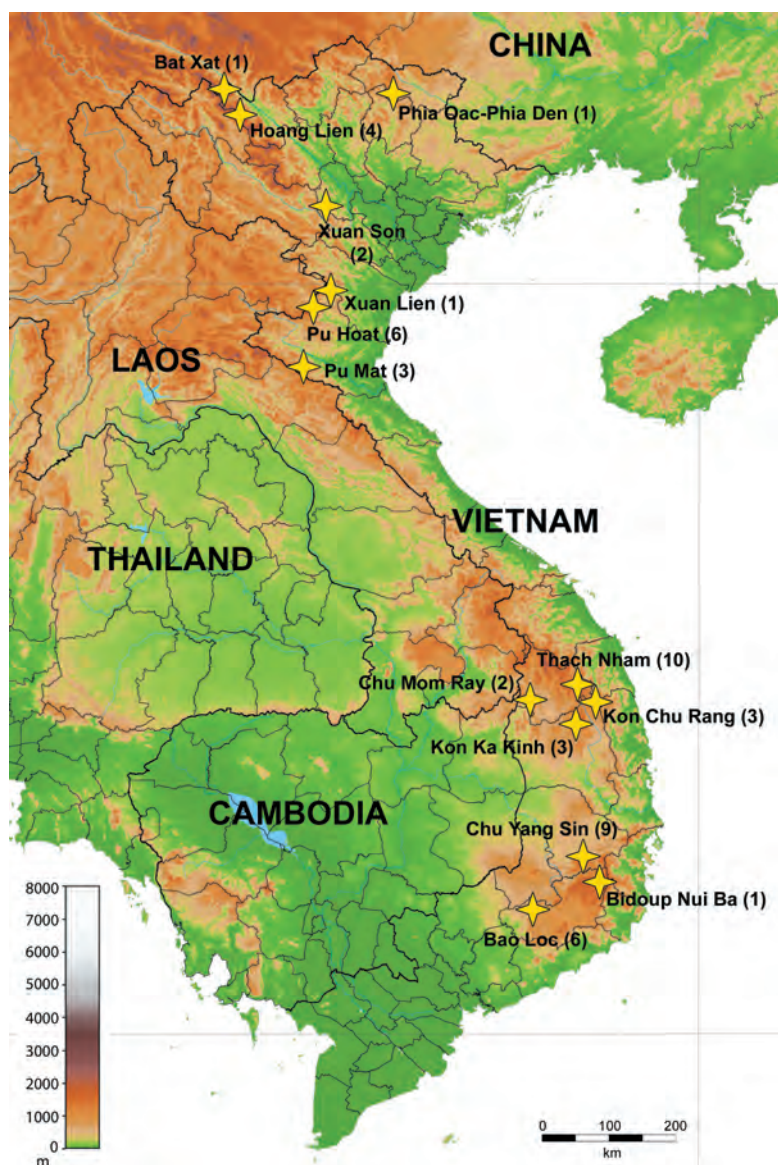
Figure 2. Map of Vietnam with localities of our collections. Figures in brackets represent number of collected non-photosynthetic plant species.