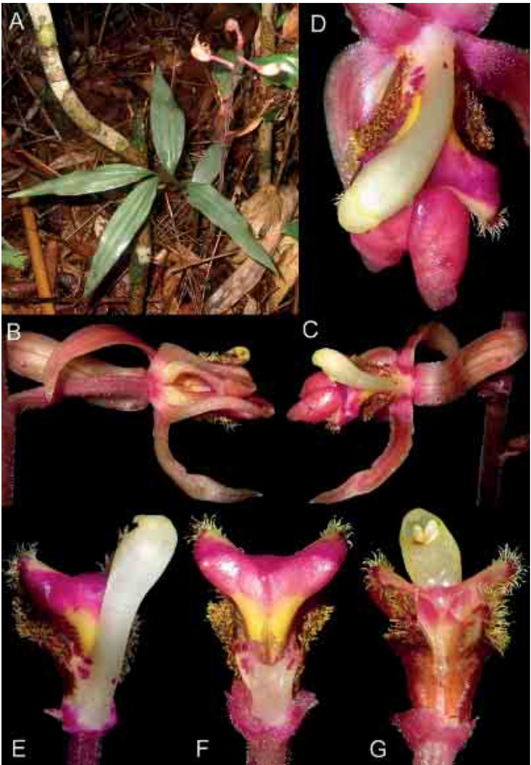
Figure 3. Plocoglottis quadrifolia in Chu Yang Sin National Park (Vietnam): A – plant in natural habitat; B – flower, bottom view; C – flower, top view; D – details of lip and column; E – lip and column, adaxial view; F – lip, abaxial view; G – lip and column, abaxial view. Nuraliev 1010 .