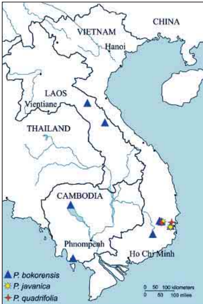
Figure 4. Distribution of Plocoglottis species in Cambodia, Laos and Vietnam.

Khanh Hoa province, Khanh Vinh district, Khanh Dong municipality, around point 12°25'N 109°00'E, among rocks along stream bank, collected as living plants by local people, bought by Tran Thanh Tung in Nha Trang city in January 2015 and cultivated in his orchid nursery near Nha Trang city, January 2015, Tran Thanh Tung 31 [LE!].