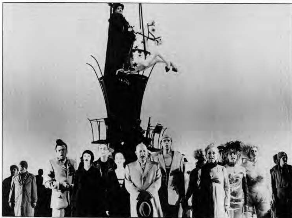
The principals of the Frankfurt Schauspielhaus production of Die Dreigroschenoper.