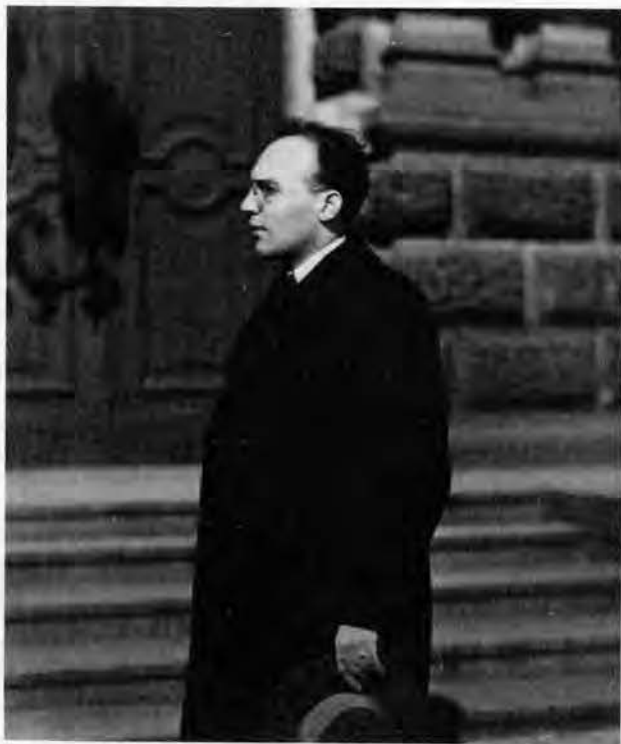
Weill at the premiere of Der Protagonist in 1926.