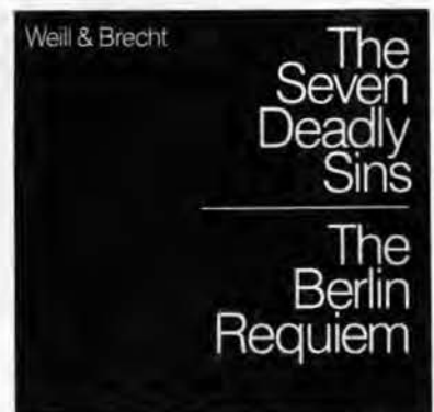
The CD booklet cover of the recording of Die sieben Todsünden featuring Gisela May, conductor Herbert Kegel and the Leipzig Radio Symphony Orchestra.