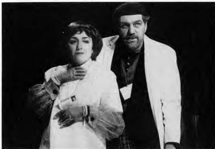
A pair of couples from the Donmar Warehouse Threepenny Opera. Above: Mr. and Mrs. Peachum (Tom Mannion and Beverley Klein). Right: Jenny (Tara Hugo) and Macheath (Tom Hollander).