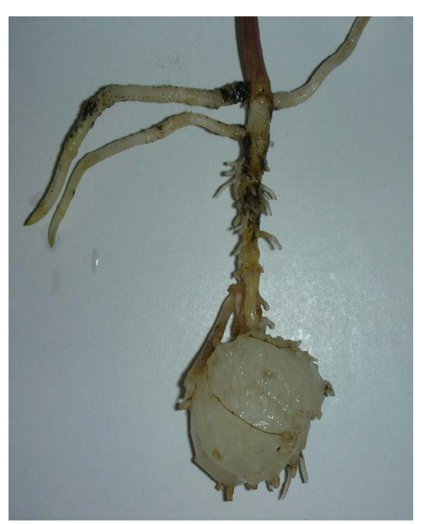
Fig. 3. Tubers of Nervilia gammieana