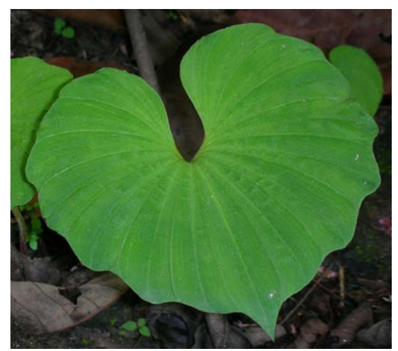
Fig. 2. Leaves of Nervilia gammieana

Nervilia aragoana sensu Stewart in Pak. J. Forest. 11 (1): 60. 1961 non Gaud.