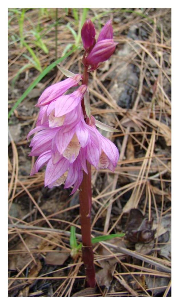
Fig. 4. Inflorescence of Nervilia gammieana