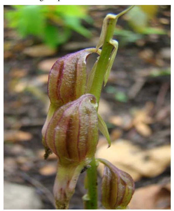
Fig. 5. Mature fruits of Nervilia gammieana

We found Nervilia gammieana growing under Sal forest (Shorea robusta) at the altitude of 600-900m. This species enjoys the moist humus rich soil. In Nainital area this species has attained higher elevation of 1700m under Ouercus leucho-trichophora-Pinus roxburghii forest community. It is also found in the middle elevation range where generally chir pines hold the complete stand. This species flowers and reaches its extreme stage at the end of the summer season surprisingly at a time when most of the forest in Kumaun Himalayas is burning up in flames due to the forest fires. In most of the surveyed areas, we were not lucky enough to find any flowering scape of this species but as soon as the first monsoon shower touched the scorching earth, the leaf began to develop. It would be necessary to bring to notice that during our survey, the entire area was affected by forest fire. This means that probably most of the flowering scapes had been burnt down into