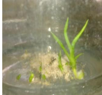
Fig.5. Initiation of shoots after 12 weeks of culture