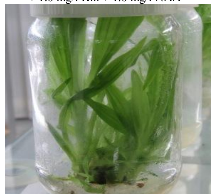
Fig.7. In vitro developed plantlets ready for acclimatization