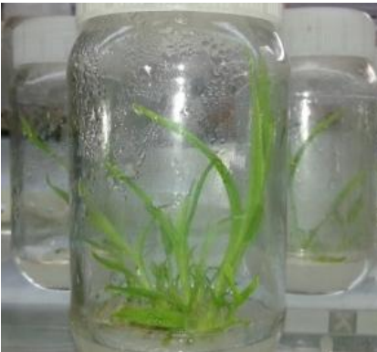
Fig.6. Shoot multiplication after 20 weeks of culture in MS +1.5 mg/l Kin + 1.0 mg/l NAA