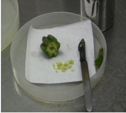
Fig.2. Seeds extraction from the green pod of Phaius tankervilliae