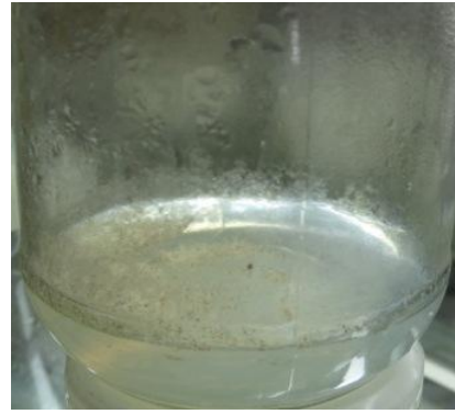
Fig.3. Hormone free MS media after 10 weeks of culture