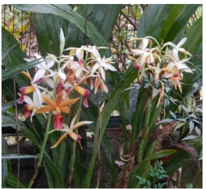
Fig.1. Phaius tankervilliae in full bloom