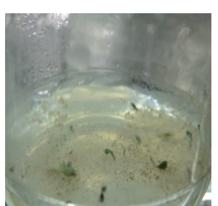
Fig.4. Seed germination and PLBs formation after 7 weeks of culture in MS + 1.0 mg/l Kin + 1.0 mg/l NAA