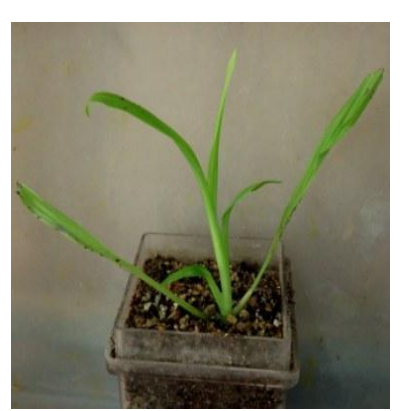
Fig.8. Hardened plantlet on potting mixture

The same hormonal composition was found effective for production of tallest shoot height (6.85 cm) as well as maximum number of roots per plant (6.20). However, MS medium when supplemented with 1.5 mg L<sup>-1</sup> Kin + 1.0 mg L<sup>-1</sup> NAA produced maximum number of shoots per culture (52.27) and maximum number of shoots with roots (50.27) per culture.