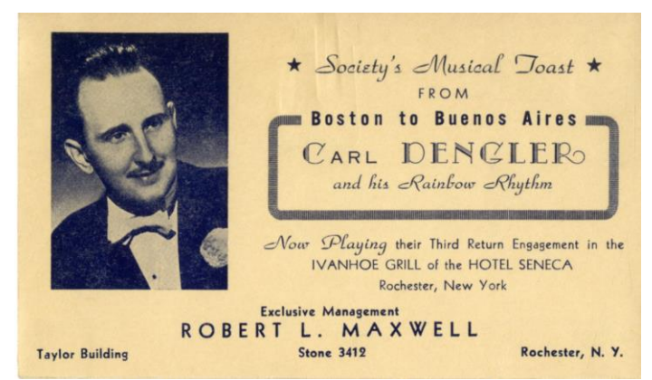
Business card for Carl Dengler (1942), from the Carl Dengler Collection, Box 46/12.