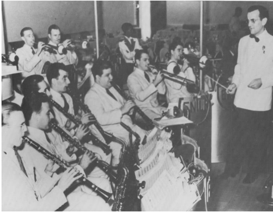
Glenn Miller and his Orchestra Adolphus Hotel, Dallas, Texas, September 1937