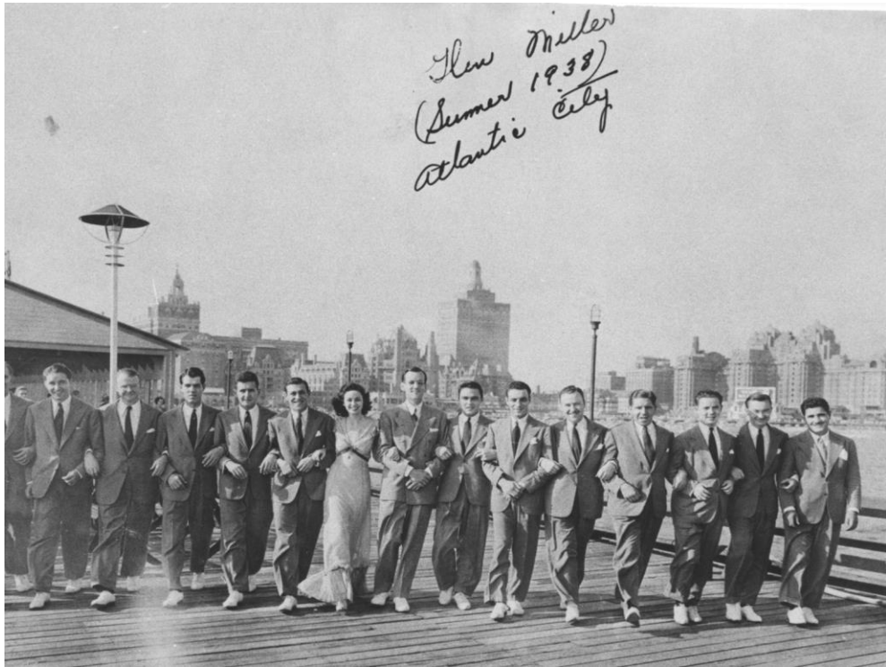
Glenn Miller and his Orchestra - Atlantic City, New Jersey