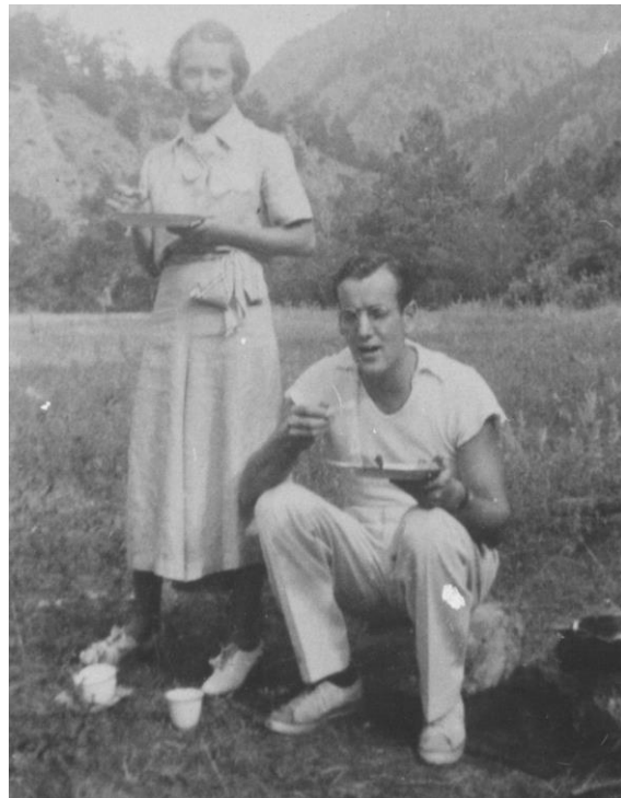
Helen and Glenn Miller Outside Boulder, Colorado, circa 1936