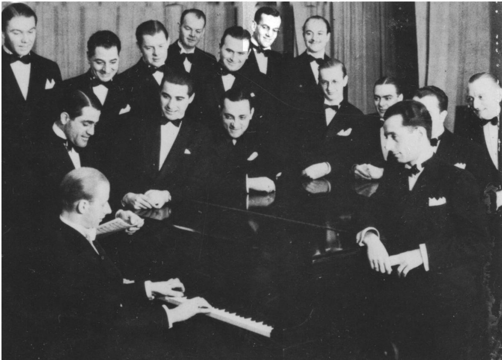
Ray Noble and his American Orchestra (Glenn Miller highlighted)