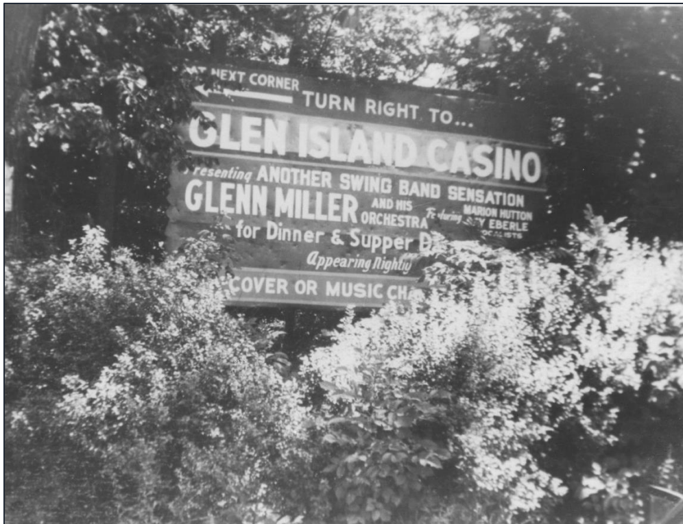
"Along the Waters of Long Island Sound"