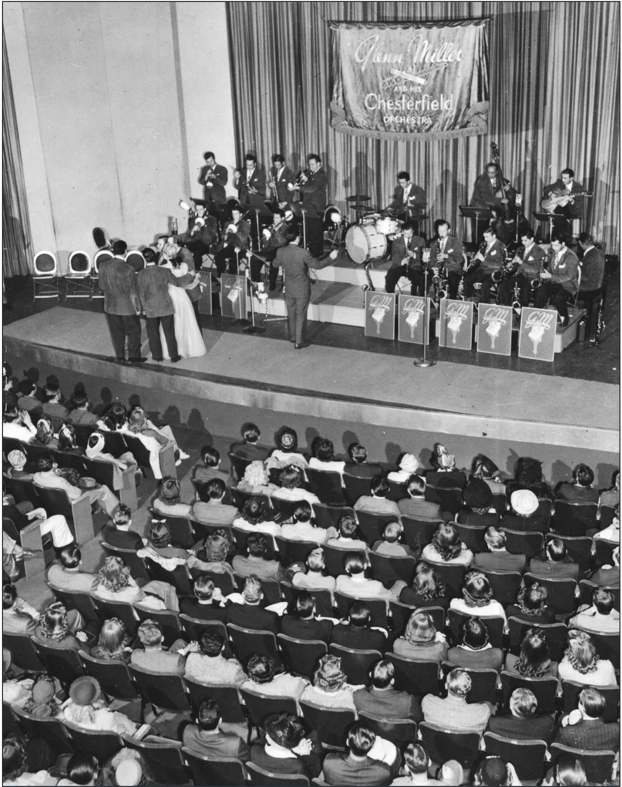
America's Number One Band Chesterfield Moonlight Serenade Hollywood 1942