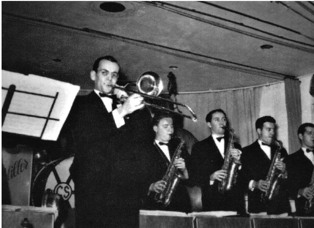
Glenn Miller at the Paradise Cabaret and Restaurant, 1617 Broadway, New York