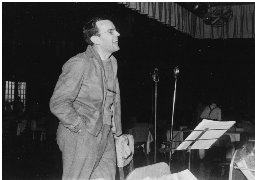
Glenn Miller at the Glen Island Casino