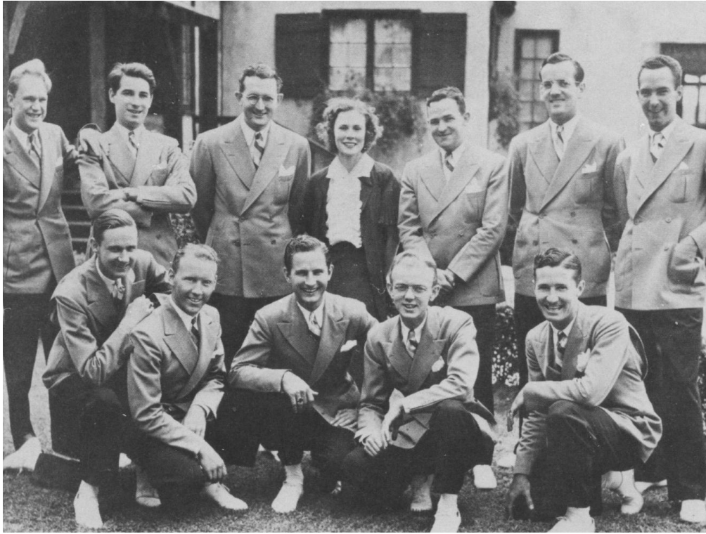
Dorsey Brothers Orchestra