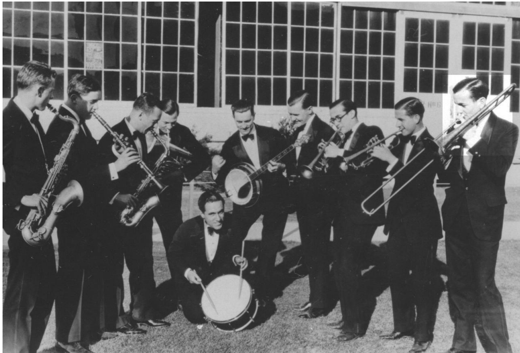
Ben Pollack and his Californians (Glenn Miller highlighted)