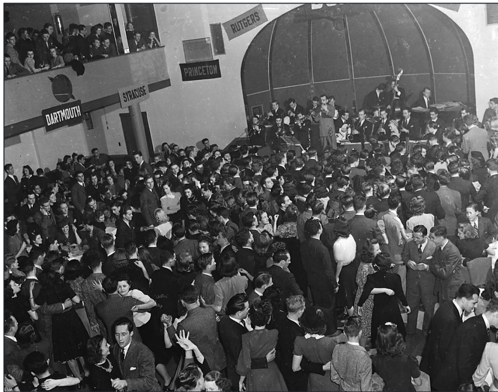
Glenn Miller and his Orchestra at the Meadowbrook Ballroom November 1939