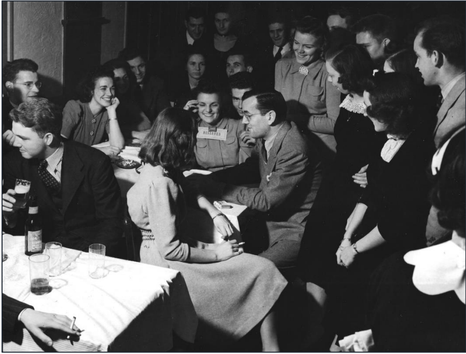
Glenn Miller and fans at the Meadowbrook