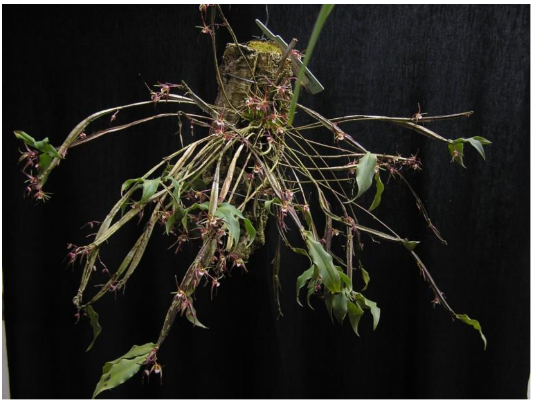
Annual Show Class 1(s): Australian epiphytic – species; Champion Specimen: Thelychiton tetragonus 'Urunga' Grower: Bill Ferris