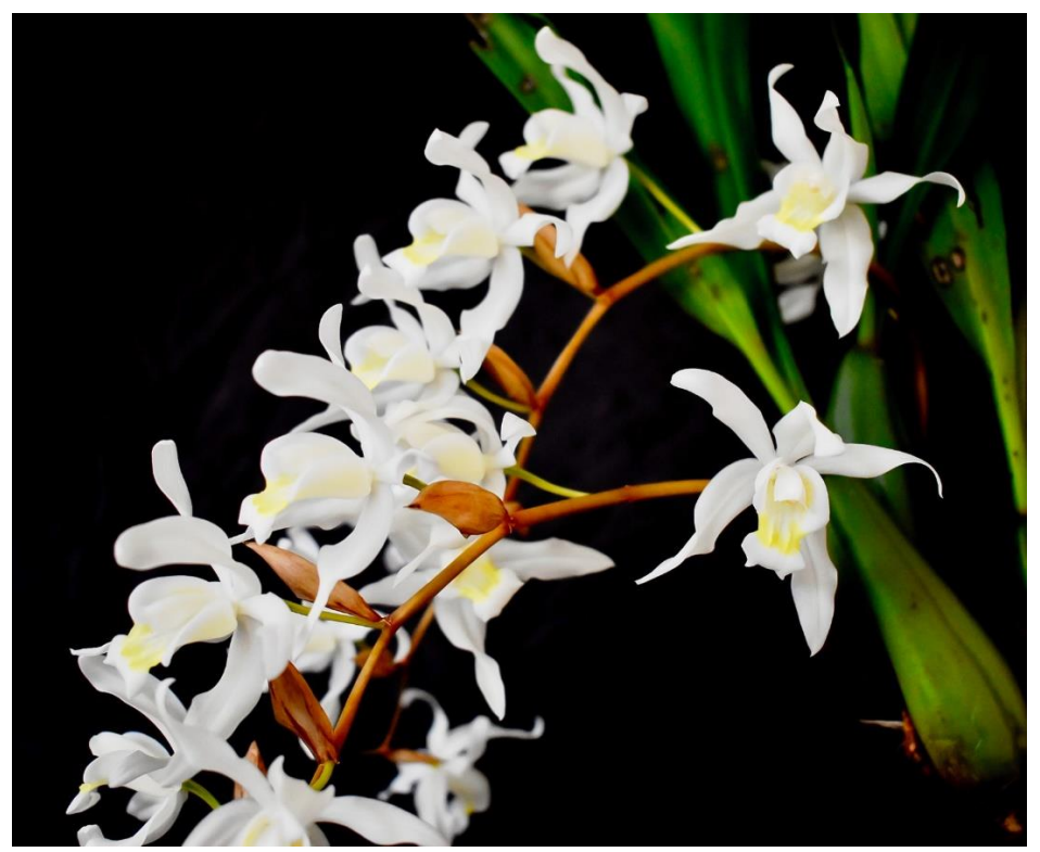
Coelogyne Unchained Melody