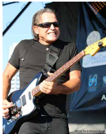
Tommy Castro at the 2015 San Diego Blues Festival

I hope that Bluesletter readers will join Tommy Castro and the Painkillers in Tacoma, Seattle or Conway as I have always thought that Tommy Castro was one of the most talented bluesmen of his generation. I've included a review of Killin' It Live in this issue and look forward to his next release on Alligator Records.