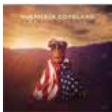
Shemekia Copeland America’s Child (Alligator Records)