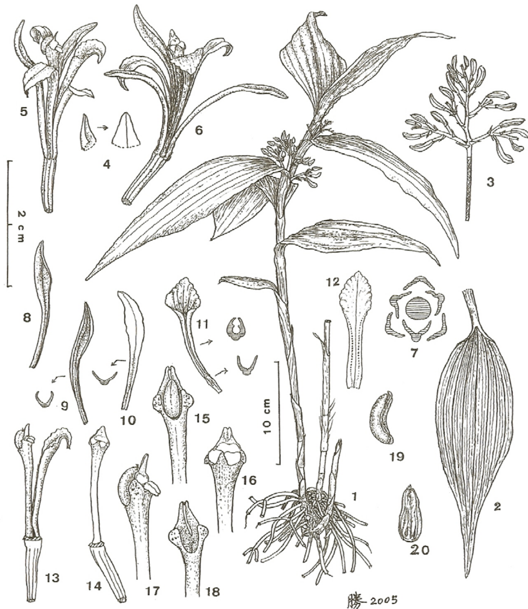
Fig. 2. Corymborkis veratrifolia (Reinw.) Bl. 1: Habit. 2: Leaf. 3: Inflorescence. 4: Floral bract. 5: Flower, side view. 6: Flower, ventral view. 7: Cross section of a flower at 5 mm above the ovary. 8: Dorsal sepal. 9: Lateral sepal. 10: Petal. 11: Lip. 12: Lip, flattened, dash lines on the claw showing ridges. 13: Column and lip, side view. 14: Column, ventral view. 15-17: Apex of column, dorsal, ventral and side views. 18: Column, ventral view, anther removed, showing the clinandrium and hamulus. 19: Anther, side view. 20: anther, inside. (Drawn from fresh materials).

region of the island of Lanyu ( Orchid Island, Botel Tabago, Fig. 3 ), Taiwan.