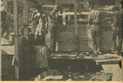
Delta Co-operative Farms, Mississippi