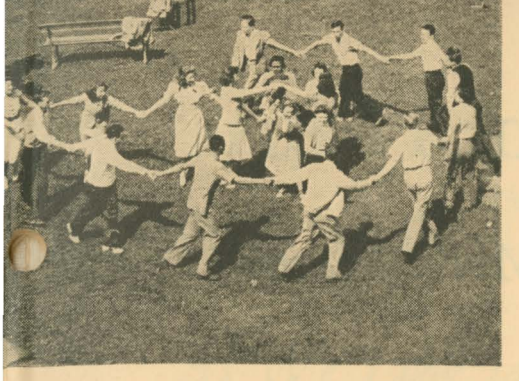
The Caravaners train the community young people in folk games.