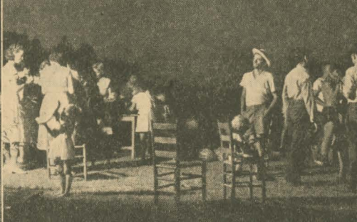
Macedonia, Georgia, co-operative community