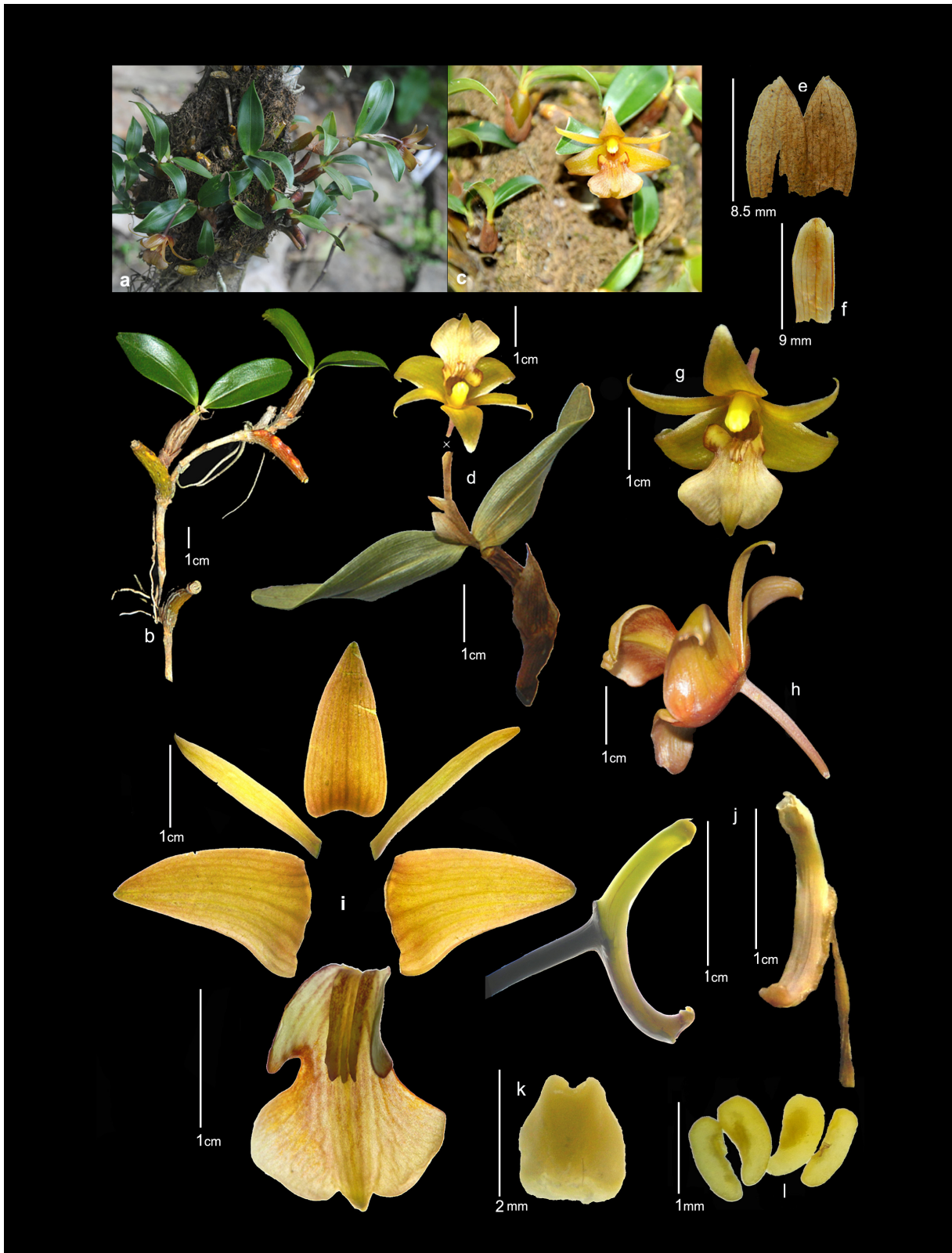
Fig. 1. Epigeneium treutleri (Hook.f.) Ormerod: a & b. Habit; c & d. Inflorescence; e. Peduncle sheaths, f. Floral bract; g & h. Flower front & side views; i. Floral perigone with lip (front view); j. Column side views with pedicel and ovary; k. Anther front view; l. Pollinia.