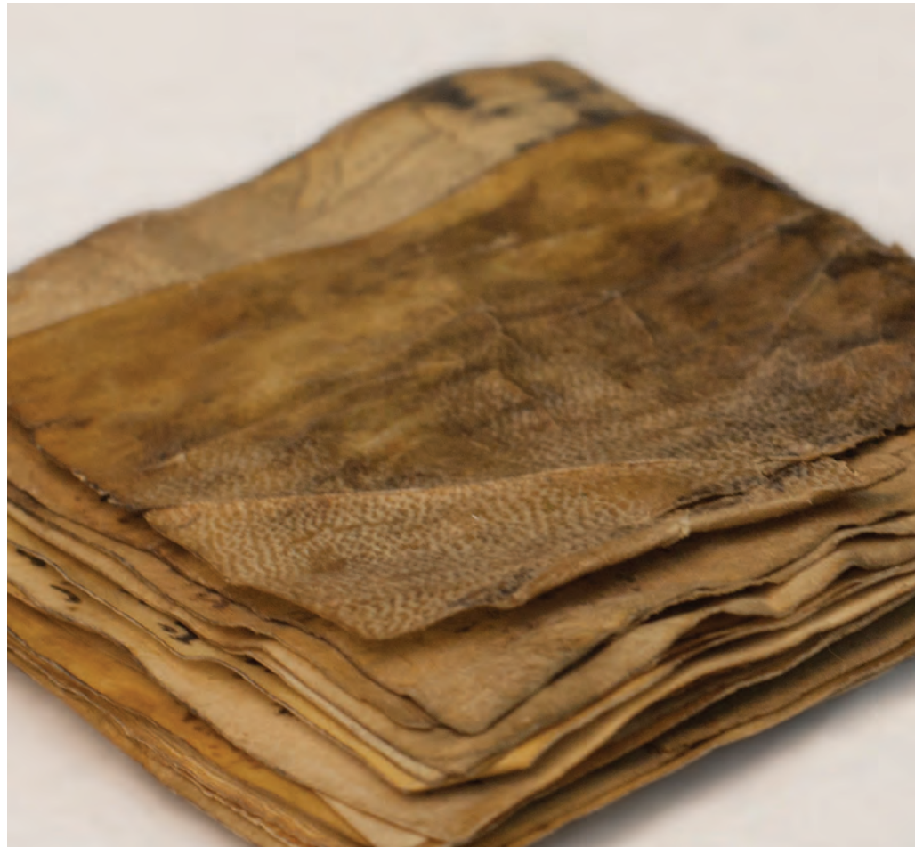
RIGHT The Green Collection contains biblical texts and ancient artifacts.