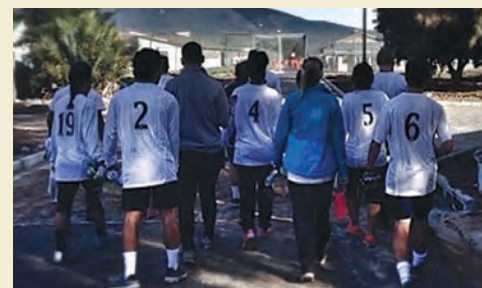
Team South Africa walks with a soccer team near Cape Town.

Team Zambia traveled to Lusaka, Zambia, and used business development strategies learned at ORU to connect and minister with local businessmen. The team partnered with local churches to run business conferences as well as entrepreneurship workshops.