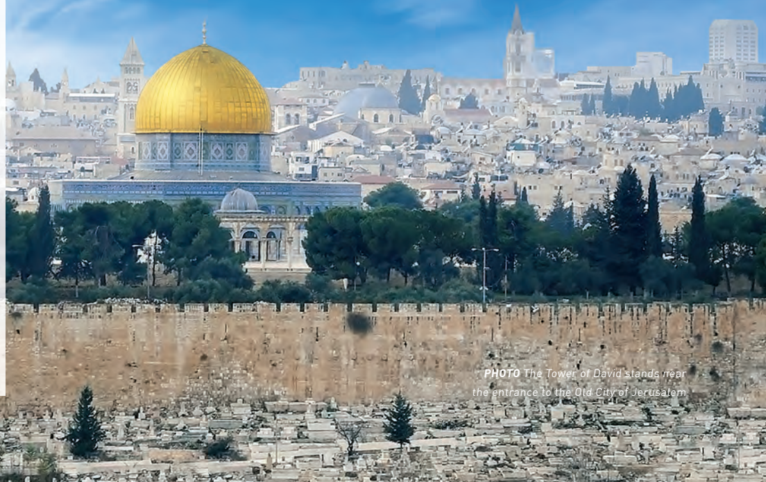
PHOTO The Tower of David stands near the entrance to the Old City of Jerusalem.

Over the next few pages, you will read their stories and learn how they are reaching the people of this region, as well as how the Holy Land has ministered to their lives.