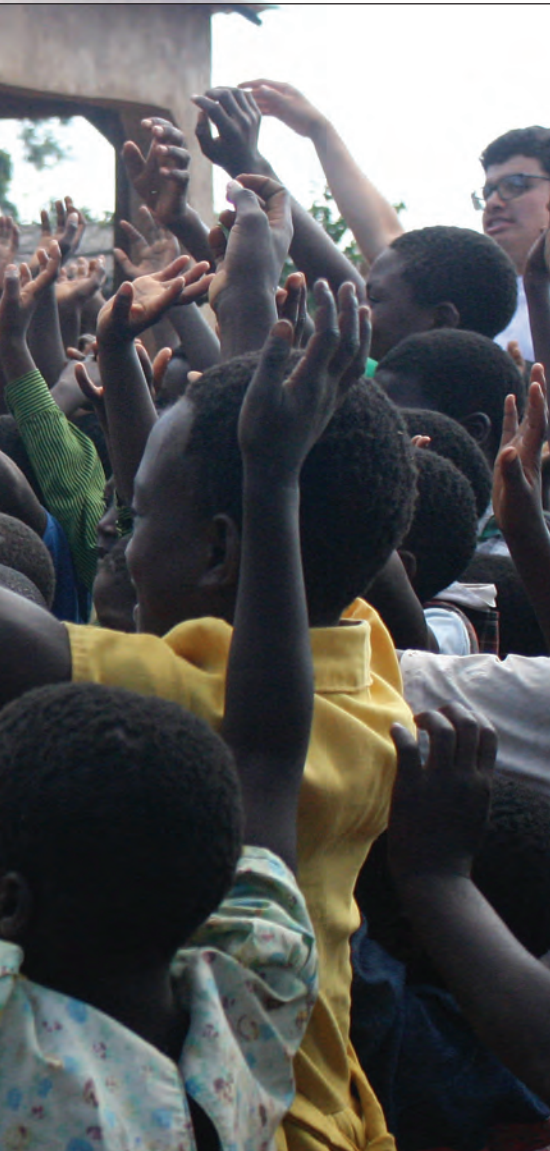
Team Malawi worships at a local orphanage. They worked with Urban Promise in Lilongwe and Victory Children's Home in Blantyre.

guay, Philippines, Russia, South Africa, South Korea, Tanzania, Thailand, Uganda and Zambia.