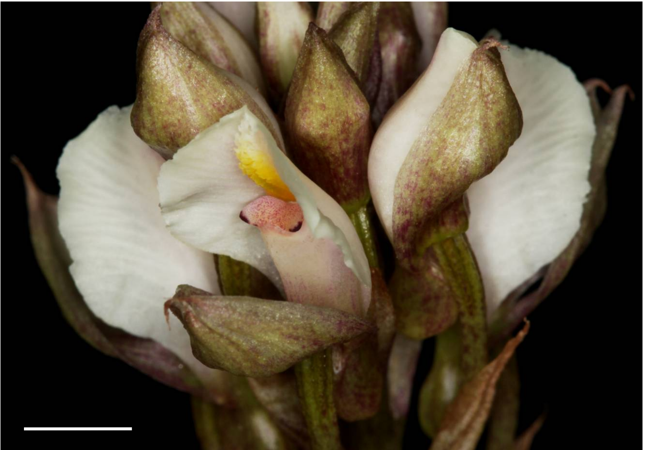
Fig. 4. A close-up of the flowers. Scale bar = 10 mm.