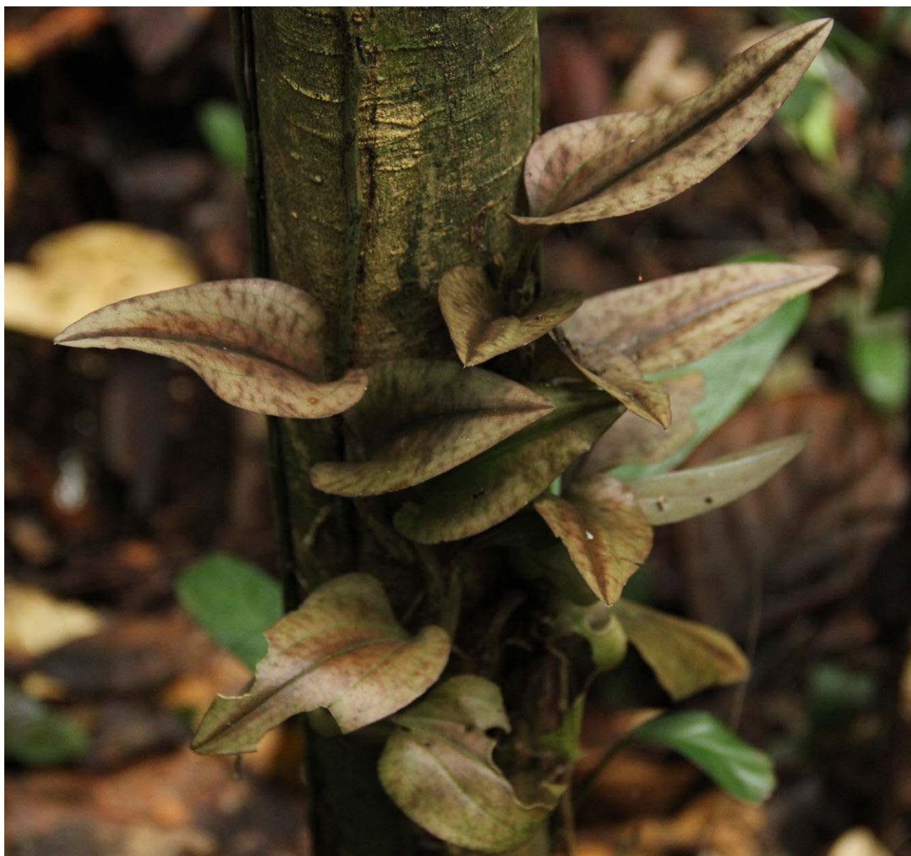
Fig. 1. Nephelaphyllum pulchrum climbing up a tree trunk in Nee Soon Swamp Forest.

This paper documents the distribution and status of Nephelaphyllum pulchrum Bl. (Figs. 1, 2) in Singapore. Nephelaphyllum is a small genus of about 11 recognised species distributed from China, Japan, India, and throughout Southeast Asia (Comber, 1990 & 2001; Seidenfaden & Wood, 1992; Cootes, 2001; Govaerts et al., 2005). Two species are recorded from Peninsular Malaysia, of which only Nephelaphyllum pulchrum occurs in Singapore (Keng et al., 1998; Tan et al., 2008; Chong et al., 2009).