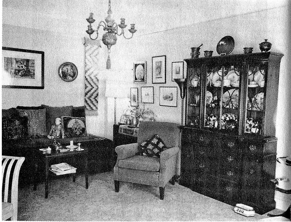
FIGURE 3. Ambros Adelwarth's living room. 333

Both of these domestic spaces appear in a book that thematizes emigration and exile and whose characters are never shown in an environment that resembles a home in the intimate Bachelardian sense. Instead of a place for imagining, these domestic spaces seem to be, at best, spaces for memory and, at worst spaces that stymie thought and feeling. In that context, it is not surprising that these homes are cold and lack in personality. However, when we consider the homes inhabited by Austerlitz, it is striking to see the same coldness present in two of the most important domestic spaces in the text – the house in Bala, where he lived with his adoptive family, and his own house in London.