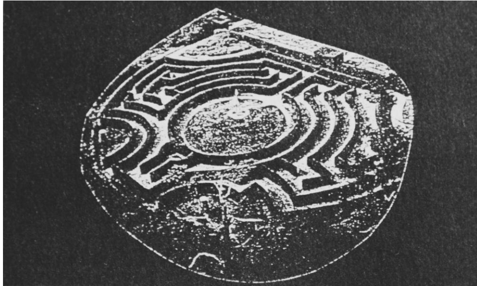
FIGURE 1. Photograph of the Somerleyton Park yew maze. 128

Significantly, in this passage Sebald provides the only image of the maze at Somerleyton but it is reproduced from a poor photocopy and the garden surrounding the maze has been crudely masked so that the maze appears, roughly head-shaped against a black background. The actual design of the labyrinth does look something like the cross-section of a skull, although the image has also been cut into this shape, with the serpentine pathways of the maze resembling the ridges of gray matter within.