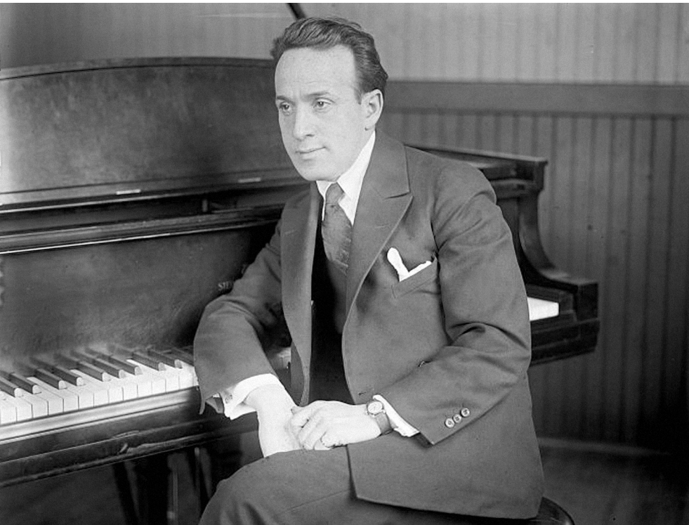
Nathaniel Shilkret in the 1920s