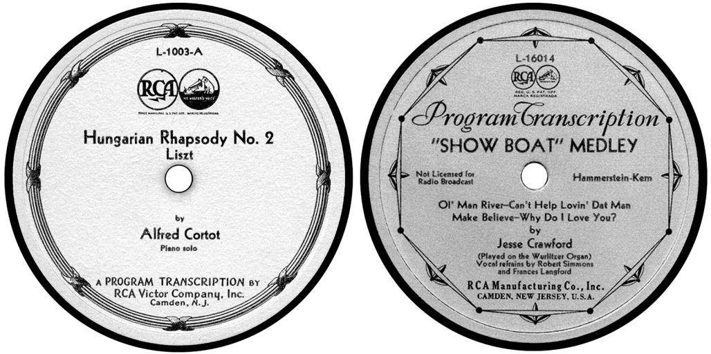
Two versions of the Program Transcription label; the earlier is on the left.