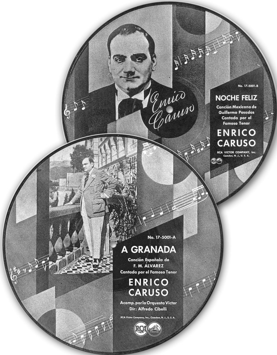
The Caruso picture disc. Although not rare, it commands high prices at auction.

The Philadelphia Symphony’s recording of the “Gurre Lieder,” listed in this volume as a long-playing record, is different from the 78-RPM set that was recorded at the same time. It features an enormous number of musicians, including four choral groups, and the description of the recording as listed in the ledgers is so sketchy that it is almost worthless.