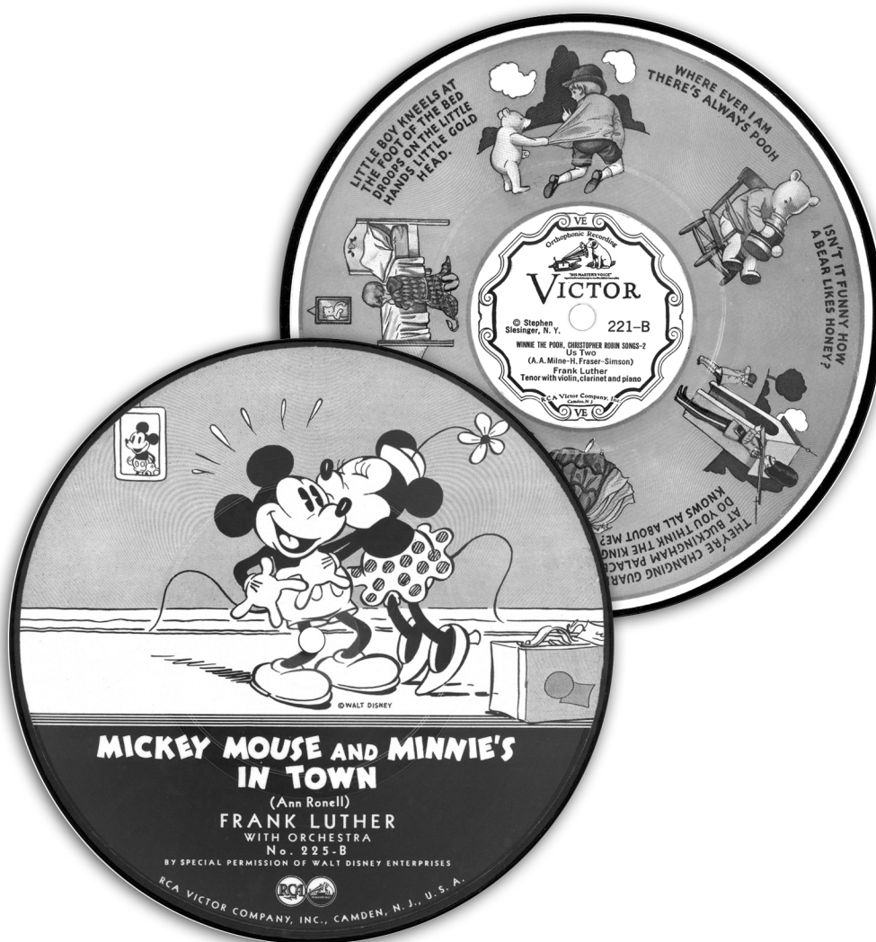
Seven-inch children's pictures discs from 1932–1933

There are a few records in this volume that seem out of place. Enrico Caruso was featured on a picture disc. It is not rare, but it sells for high prices on eBay and other record auctions. A recording of “The Raven” by the Philadelphia Symphony Orchestra was released on two long-playing picture record which were given numbers (2000 and 2001) that seem to belong in the Electradisk budget series. As a classical recording, it should have been released as a Victor Red Seal record. Curiously, record numbers 2000 and 2001 were not used in either the Electradisk or the Red Seal series.