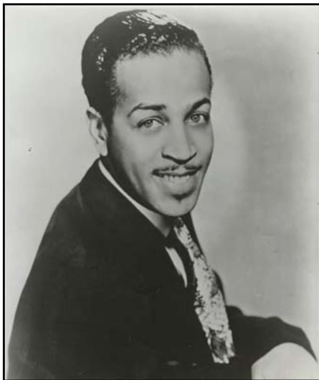
Wynonie Harris promotional photo from the Billy Vera Collection.

A massive voice, a charismatic personality and music filled with the joy of living and the undying appeal of good times