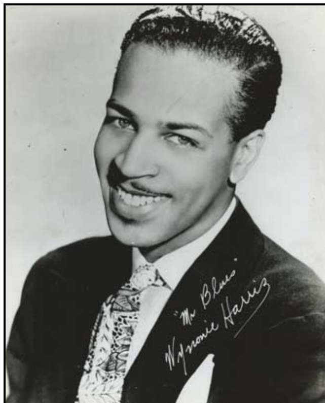
Wynonie Harris promotional photo.

In 1960, his last released single appeared, on Roulette. 'Sweet Lucy Brown' is another straightforward twelve-bar, and Wynonie shouts it out grand style, with a vocal group adding a more contemporary aspect and Hal Singer energetically booting the band along. The flip was a remake of 'Bloodshot Eyes', pretty good, but never going to recapture the magic of the original. There were a few more sides cut for the label that year and the next, although these stayed unissued until the CD age, when they turned up on a Sequel CD 'Roulette Rock & Roll Volume Two', Sequel NEM