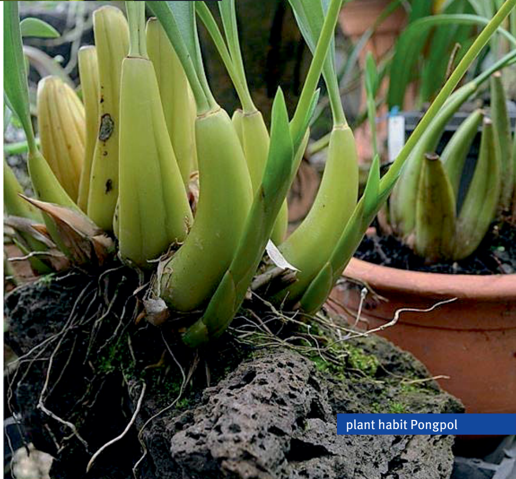
plant habit Pongpol

Flowers about 6 cm across opening simultaneously widely, sepals and petals pure white, lip ochre-coloured, inner part of side-lobes veined red-brown, mid-lobe deep red-brown; keels yellow with a dark brown apex, column golden yellow bordered with brown at base, anther white; sepals many nerved midrib prominent below, elliptic acute, the median almost parallel to the column, 3.5 x 1.6 cm, the