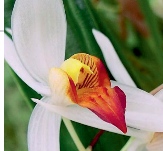
lip close-up grower and photo: © Nison RUANGSRISARAN

of a mesa-like mountain in Phou Khao Khouay National Bio-Diversity Conservation Area, Vientiane, at an elevation of about 500 m. Flowering: April, May. Our plant is cultivated in full light in the warm green-house, allowing to dry between the watering, with a drier rest when the pseudobulbs are adult until the new growth appears. Acknowledgments The authors thank André SCHUITEMAN, Sompong SRISATTAYASATHIAN and Nisan RUANGSRISARAN for sharing informations and photos about the new species.