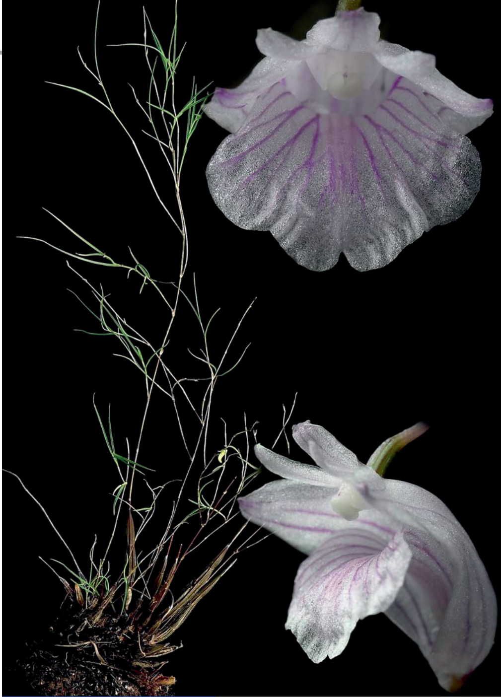
Dendrobium butchcamposii COOTES, BOOS & M.D. DE LEON

Dorsal sepal: oblong, rounded, to 2.5 mm long by 1.2 mm wide; outer surface covered with tiny papillae. Petals: narrowly lanceolate, to 1.5 mm long by 0.5 mm wide; with a central stripe. Lateral sepals: triangular, to 2.8 mm long by 1.8 mm wide; outer surface covered with tiny papillae. Labellum: oblong, fleshy, deeply furrowed on the basal half, 1.2 mm long by 0.8 mm; covered in minute papillae. Column hood: squarish, exceeding both sides of the anther cap; minute 0.6 mm long.